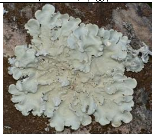
Flavoparmelia caperata (trunks + branches) Pale green – looks like melted wax