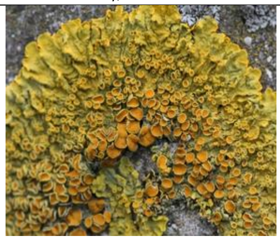
Xanthoria parietina (anywhere birds roost!) Yellow (green if shaded) with orange fruits