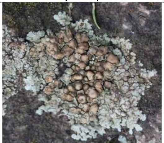
Lecanora muralis (walls, paths) Green/grey thallus with orange fruits (green when fresh and wet). On paths the lichen is often worn

To record these on NatureSpot, attach a photo. As with all lichen recording you are asked to state where it was growing, such as the type of rock, as many are specific to certain substrates.