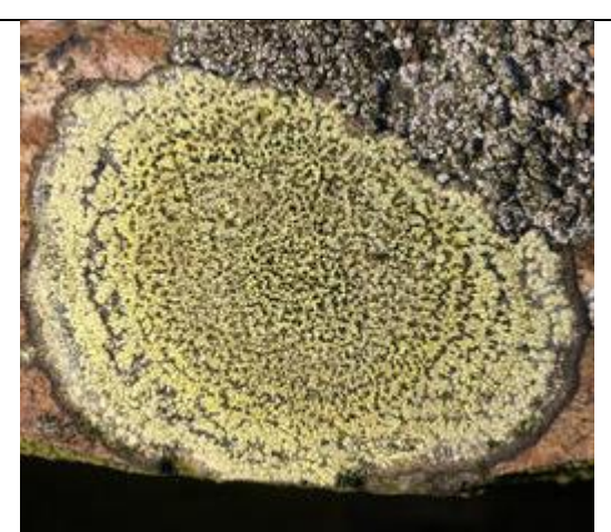
Rhizocarpon geographicum (acid rocks) Yellow with joined-up black fruits