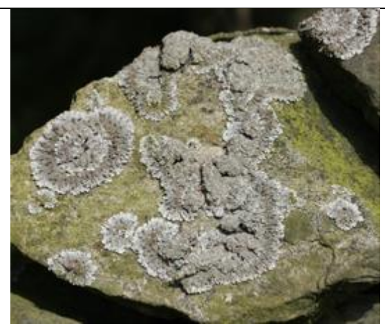
Parmelia saxatilis (acid rocks) Grey, rosette-like