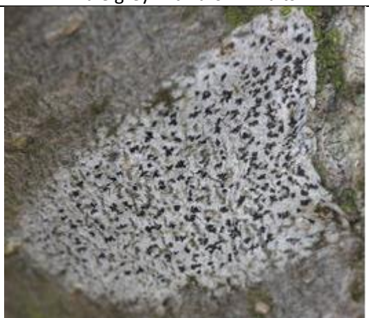
Arthonia radiata (smooth bark) Grey with black, squiggly fruits