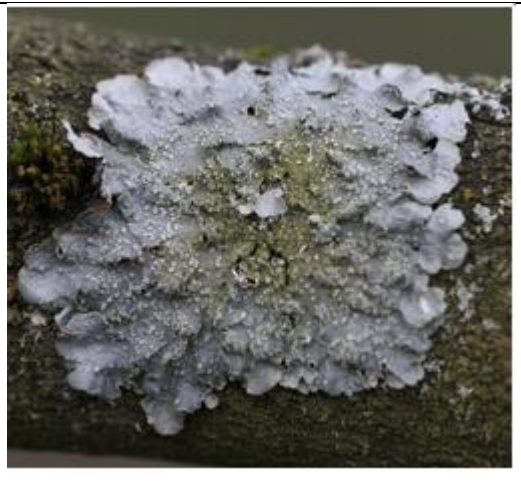
Punctelia subrudecta (trunks + branches) Similar to P. sulcata but with white spots