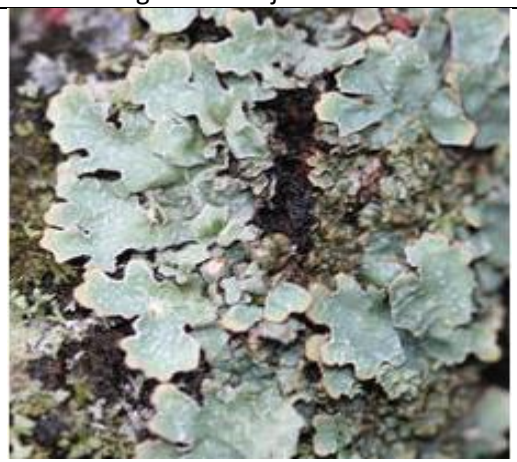
Parmelia sulcata (trunks + branches) Grey-green with white tracery