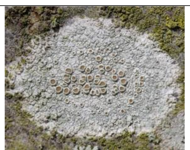
Lecanora chlarotela (smooth bark) Pale grey with brown fruits

Lichens are all around us – on trees, rocks, walls and even under our feet on tarmac paths. Whilst many are tricky to identify, there are a number of common species that everyone can learn to recognise. Here are our Top 10 to get you started.